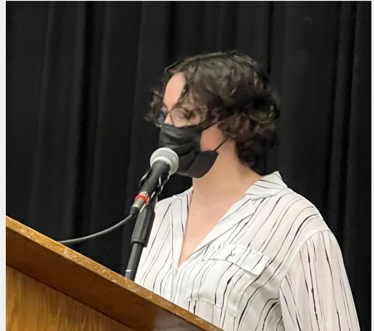
FBLA installation ceremony 2021